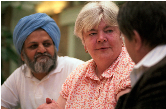
People react differently to different things

long follow-up, both of which are strengths. But it's possible that men who drink lots of green tea are also more likely to adhere to a traditional Japanese diet. This means diet may be a confounding factor. In fact, this is partly what the researchers found – that men who drank more green tea also ate more miso and soy, as well as fruit and vegetables. They also differed in other ways from men who drank less green tea. So it's difficult to say for certain whether the green tea is responsible for the lower risk of cancer or whether other elements in the diet were involved.