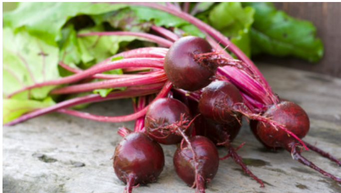
Beetroot has been called ‘the elixir of life’

Of course, there’s more to it than that. There’s a vast industry devoted to finding new ways to persuade us to eat this or that food and an army of scientists bent on exploring the links between what we eat and how healthy we feel.