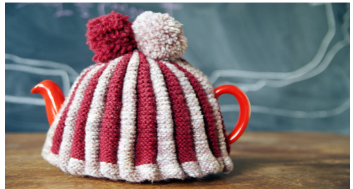
The nation's favourite drink is supposedly good for you

Miracle claims are also made for chocolate, including that a daily bar “can cut the risk of heart attack and stroke” .