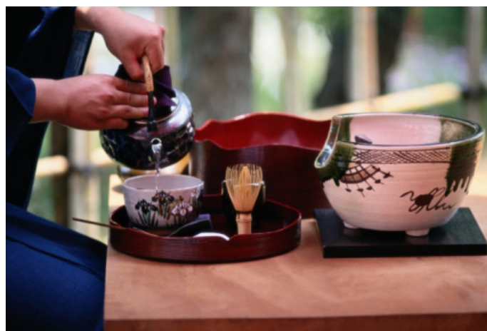
Green tea is part of the traditional Japanese diet

A study that suggested that green tea could reduce the likelihood of developing prostate cancer had a similar weakness. It found that men who drank five cups of green tea a day were about half as likely to develop advanced prostate cancer as those who drank only one cup. This study involved nearly 66,000 men in Japan, who were followed for 14 years. It was a study with a large number of participants and a