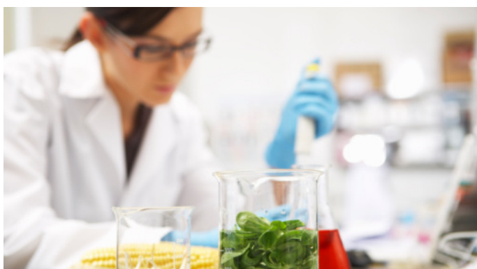
Compounds in food may react differently in the body

Sometimes, a suggested association between a food and a health outcome looks doubtful on the basis of common sense. In such cases we have to ask ourselves whether the association seems plausible. For instance, in the study linking chocolate consumption to better cardiovascular health , people who ate the most chocolate had a 39% lowered risk of heart attack or stroke compared with those who ate the least chocolate. However, the difference in consumption between those who ate the most and those who ate the least chocolate was minimal: less than one small square (5g) of a 100g bar. Common sense tells us that this difference is unlikely to account for a 39% reduction in cardiovascular risk. The idea that helping yourself to a bar of chocolate a day will stop you having a heart attack or stroke may sound attractive, but this research does not provide any basis for it.