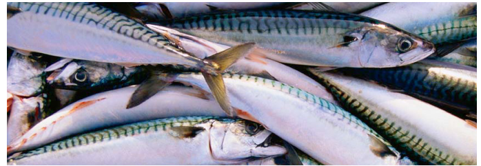
Oily fish is part of the Mediterranean diet

But just because a study is funded by the food industry doesn't necessarily mean it will be of poor quality. However, there may be a vested interest in giving a positive spin to results or getting it into the newspapers for a little publicity.