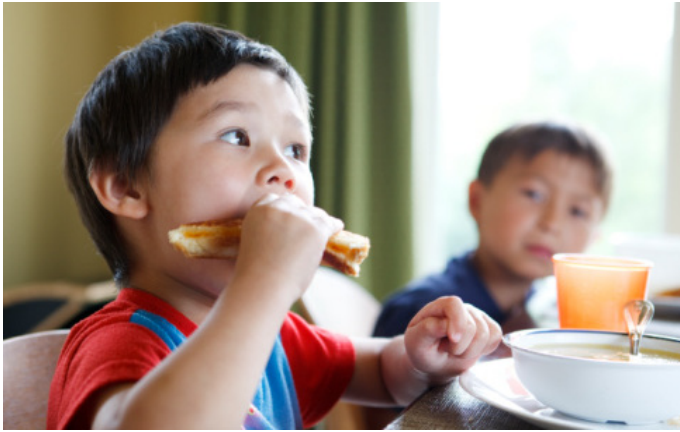
Children should eat a healthy balanced diet