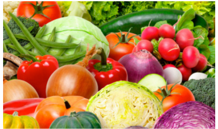
Eating plenty of fruit and veg will help to keep you healthy

Systematic reviews of RCTs in The American Journal of Clinical Nutrition , Archives of Internal Medicine and Nature have found that cocoa or chocolate can reduce blood pressure. However, they identified no RCTs looking at the effects on important clinical outcomes such as cardiovascular disease or mortality. Chocolate of any variety is high in fat, sugar and calories and, if eaten to excess, is likely to increase the risk of obesity, heart disease and diabetes. Whether any potential benefits of eating a moderate amount of chocolate can outweigh the potential harms remains to be seen.