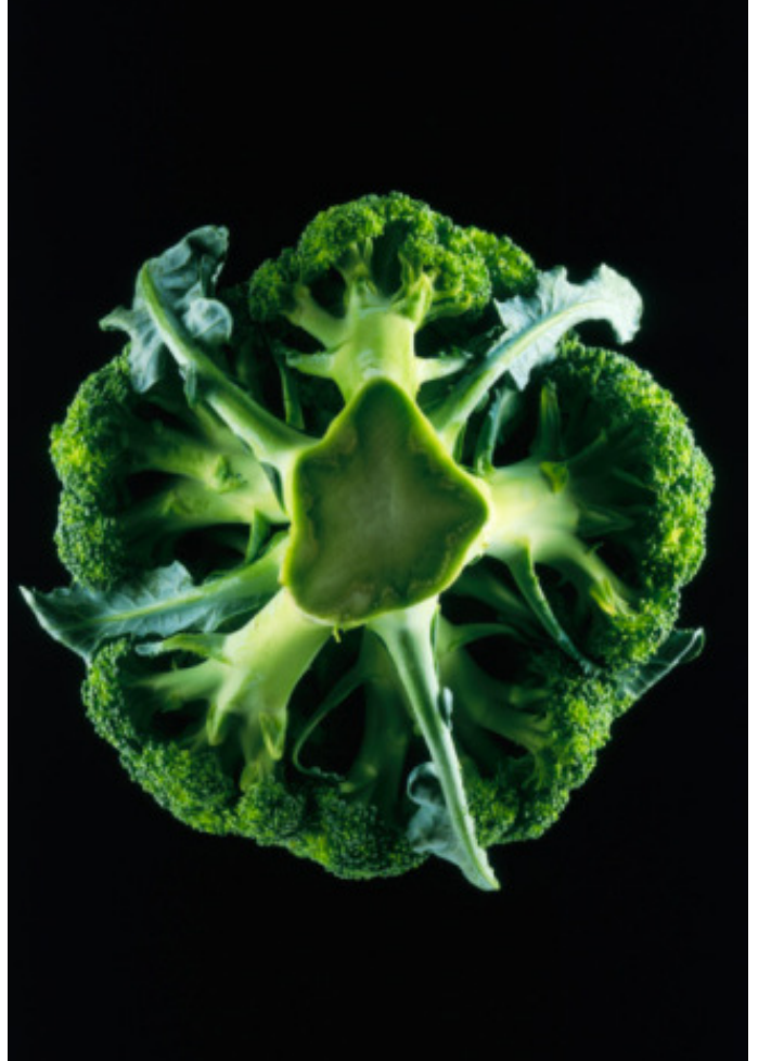
Broccoli is good for you as part of a healthy balanced diet

Eating more non-starchy vegetables, such as broccoli, is associated with a reduced risk of cancer according to the WCRF systematic review on cancer prevention (see above). It is possible that some of the compounds in broccoli may have health benefits, but clinical trials are needed to investigate this.