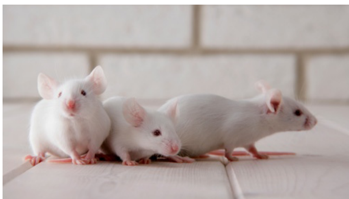
Testing on mice is not the same as testing on humans

Eating fish three times a week was associated with a non-statistically significant reduction in risk of these brain abnormalities. Even if the difference had been significant, the study could not say whether oily fish prevents memory loss, as memory was not measured. Only a trial that directly measures people's memory can tell us about the link between oily fish and memory.