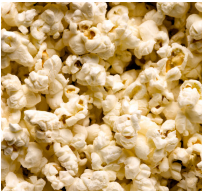
Popcorn is reputedly high in antioxidants

While broccoli can allegedly “undo diabetes damage” , “stop breast cancer spreading” and “protect the lungs” .