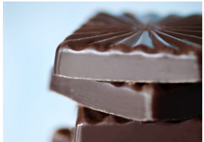
The health benefits of chocolate are debatable

Even our beloved cuppa has been given superfood status. Black tea has been alleged to protect against heart disease . Green tea can supposedly cut the risk of prostate cancer . And it has been claimed that camomile can keep diabetes under control .